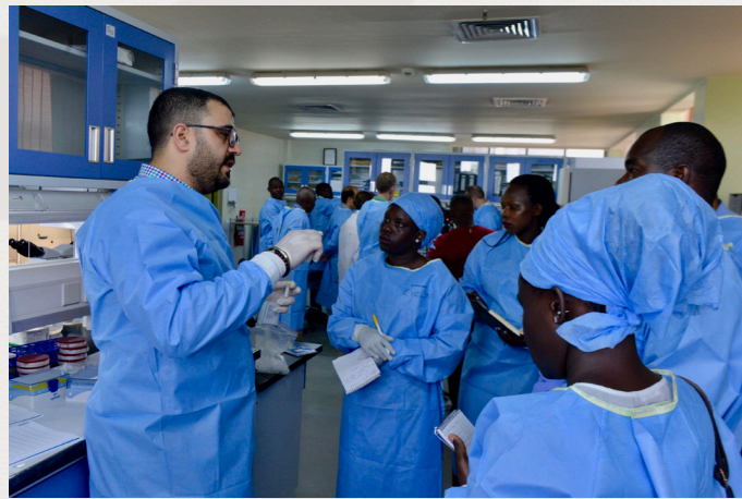
Staff in Uganda are trained on how to process and test samples in a MALDI TOF