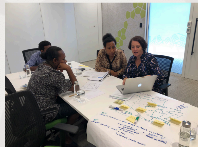
Fellowship workplans are created in a during a workshop in Papua New Guinea

Fellows and staff supported by our grant streams may receive epidemiology training including defining sample size and collection methods, developing sampling strategies, analysing and interpreting results and designing surveillance systems. Some beneficiaries may also receive training in bioinformatics.